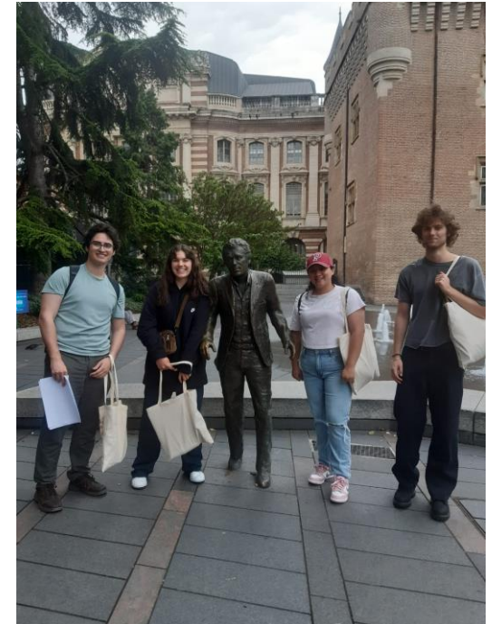
ADVENTURE TRACK IN TOULOUSE