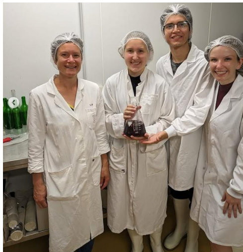
LAB WORK: MICRO-VINIFICATION