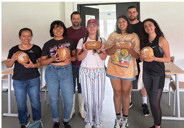
BAKING FRENCH BREAD