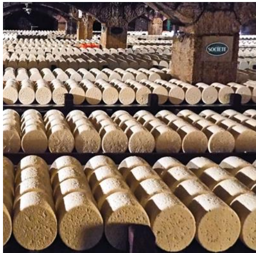
ROQUEFORT CAVES VISIT