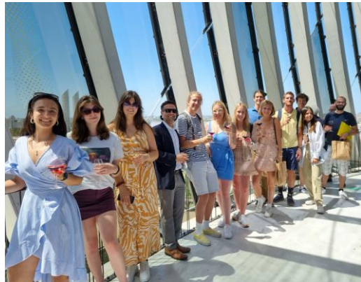
LA CITÉ DU VIN VISITING BORDEAUX