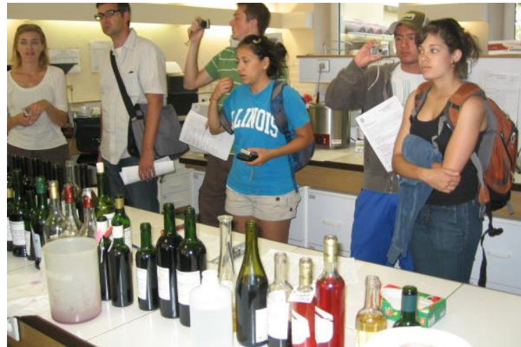
FIELD VISIT ON A VINEYARD