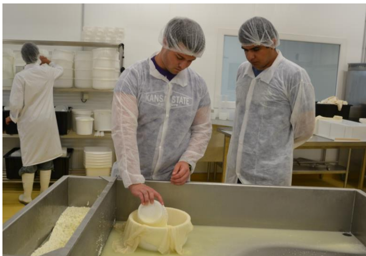
LAB WORK: CHEESE PROCESSING