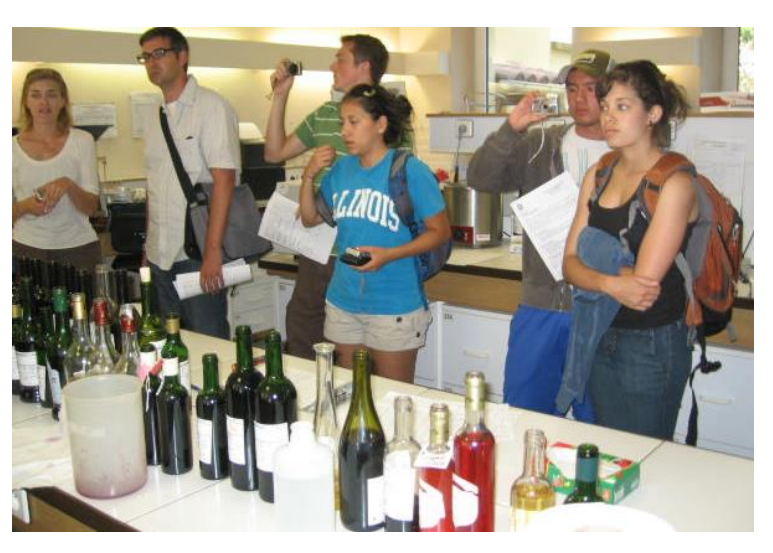
FIELD VISIT IN A VINEYARD