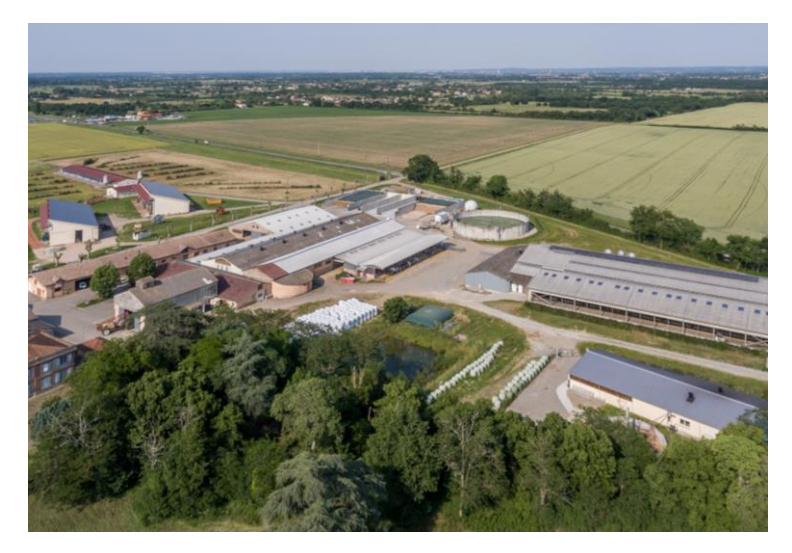
LAMOTHE CAMPUS - PURPAN FARM