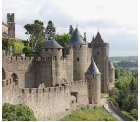
BARCELONE GAVARNIE CARCASSONNE